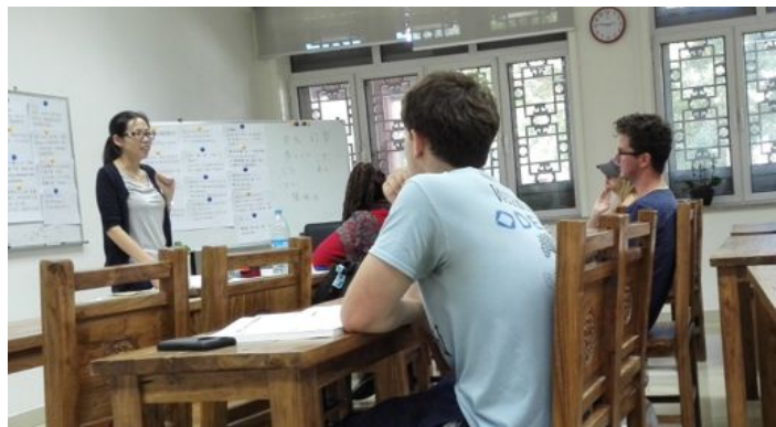
CSI Students learning Chinese